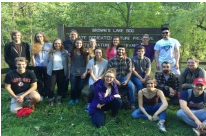
Field trip to Brown's Bog September 26, 2017