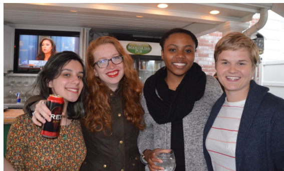
Seniors from the English class of 2017