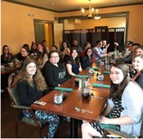
2017 SIGMA TAU DELTA inductees

Twenty-two students, who met the requirements in Wooster's chapter of Sigma Tau Delta, the International English Honor Society, were inducted at a luncheon held in the Alumni Room of the Wooster Inn on April 19, 2017.