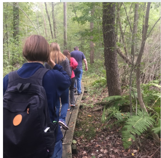
Heading to the peat bog...